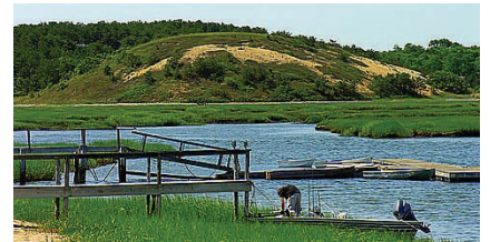
View south to Poor Hill from Pamet Harbor Yacht Club

The Town and Truro Conservation Trust worked cooperatively to acquire 3.55 acres along the leading edge of Poor Hill , a glacial sand dome rising 60 feet high straight up from Pamet Harbor. Two large homes would otherwise have been built here, marring the view of the southern end of the harbor. Poor Hill, Truro's last Land Bank acquisition, is the most significant single landform preserved by the Land Bank on Cape Cod.