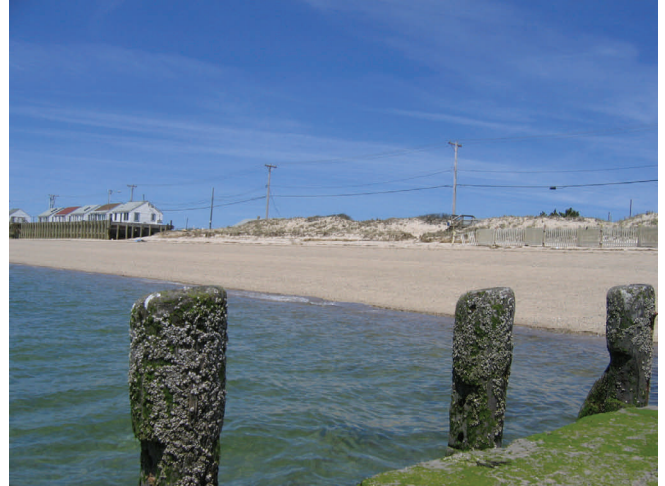
Land Bank funds were used to purchase this 1.25-acre parcel of sand beach on Beach Point from the Noons family, including public parking across Shore Road.

TOTAL COST PER ACRE: $134,750 NET LAND BANK COST PER ACRE: $100,032