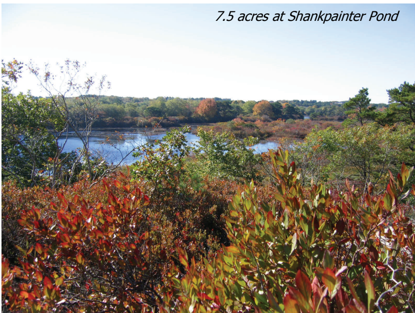
7.5 acres at Shankpainter Pond